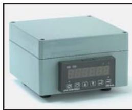
1007-ENCL8 shown with PP45 mounted.

The 1007-ENCL8, IP-65 (NEMA 4) Mounting Enclosure for 1/8 DIN controls and panel meters, allows easy use in a compact semi-portable format. The enclosure has a standard 1/8 DIN cut-out and will accommodate a PP45, LCI108, LCI108J, LCI208, LCI308, LCI408, 8500 Series, 8600 Series, LCU108, or LCU208 indicators and controls.