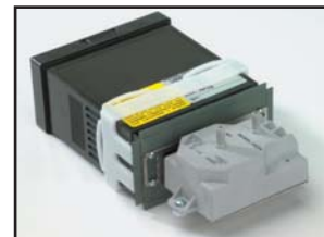
1007-BRKT8 shown mounted on PP45 with Dwyer Series 668 pressure transmitter (wiring omitted).

The 1007-BRKT8 is designed to hold a Series 668 pressure transmitter, but may also be used for other transmitters or solid state relays.